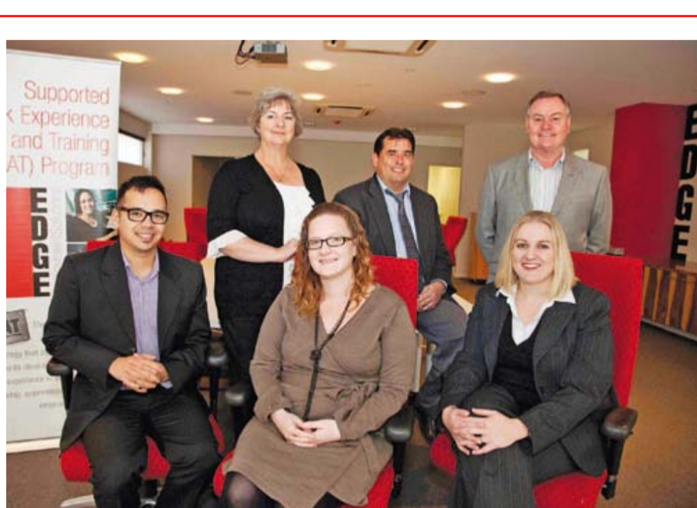
The SWEAT® Team.